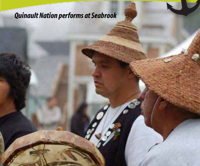
Quinault Nation performs at Seabrook