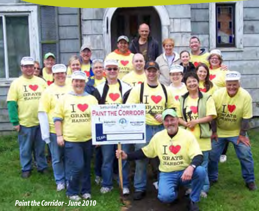
Paint the Corridor - June 2010